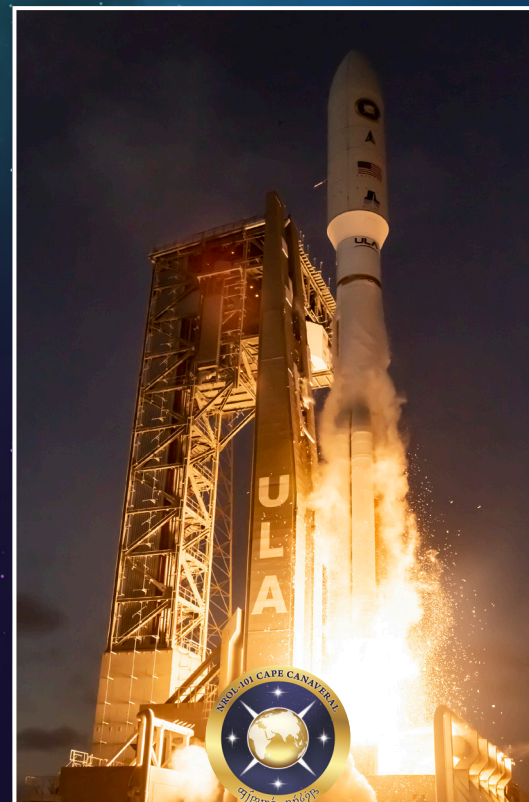
NROL-101 13 November