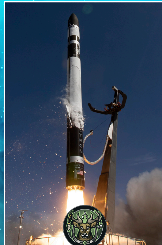
NROL-151 31 January