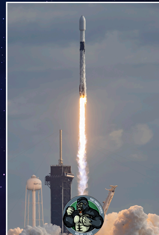
NROL-108 19 December