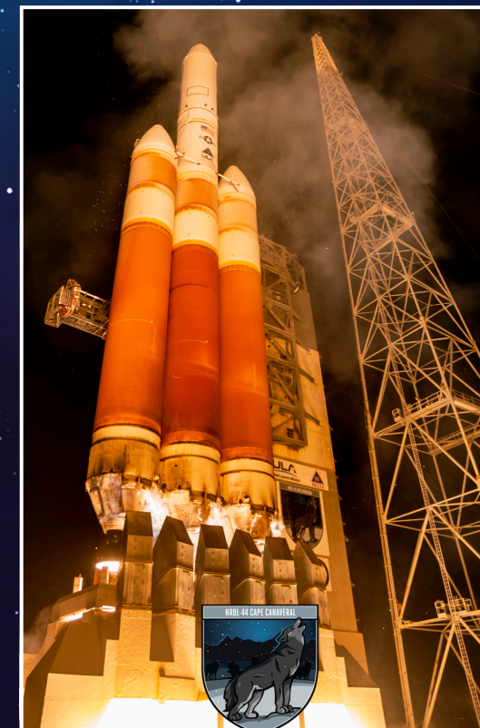
NROL-44 10 December