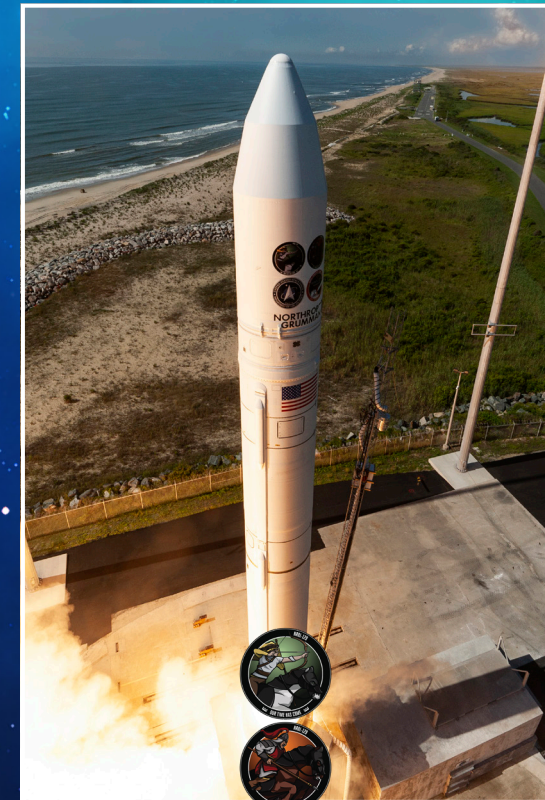
NROL-129 15 July